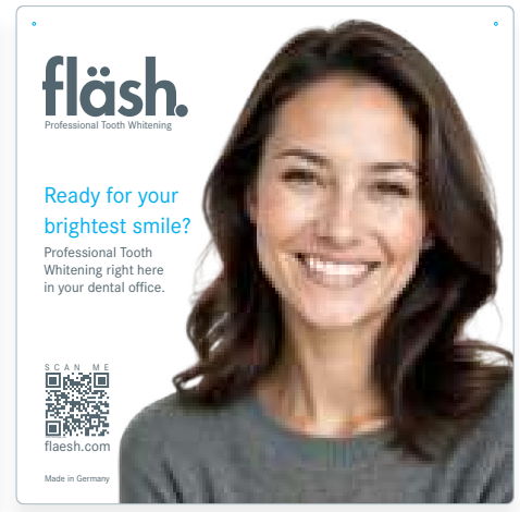
Professional acrylic wall hanger, 60 x 60 cm

Feel free to ask for further marketing support.