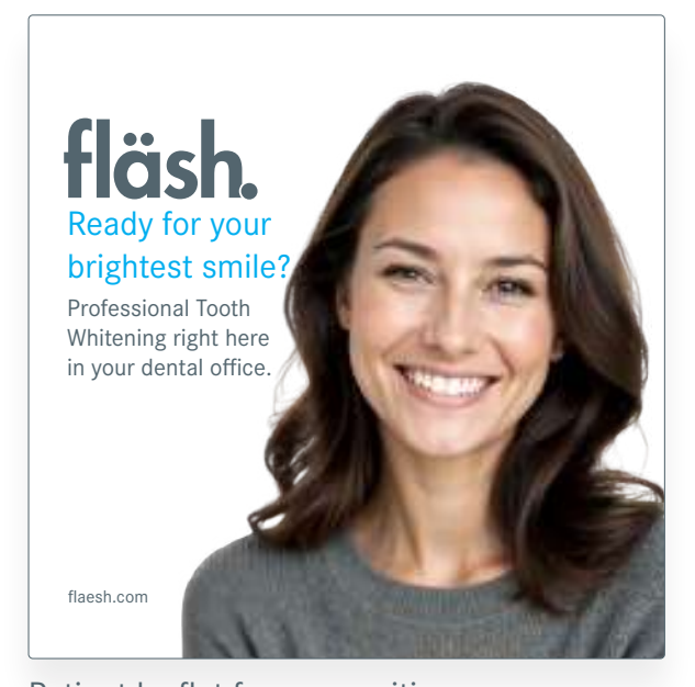
Patient leaflet for your waiting area

Digitally available on www.flaesh.com and also in the the flaeshapp.com